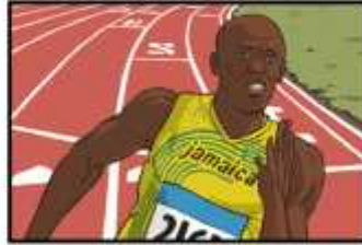
Usain Bolt, winner of three Olympic gold medals in London

Although other athletes have won more medals than Bolt, including American sprinter Carl Lewis who was commentating for a television network, no-one else can match the explosive power and unrivalled pace exhibited by Bolt.